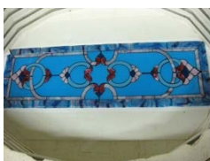
Student work: V. Orr