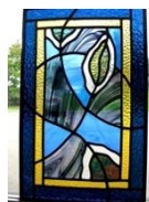
Student work: V. Orr