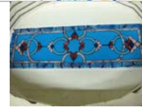
Project by V. Orr

Back by popular demand, this five-week course is for advanced fusers ready to tackle projects like vessel sinks, wall or garden sculpture, and tabletops. With one-on-one guidance and instruction, participants will plan, design, execute, and fire one large project to completion. Space is limited but the possibilities are endless!